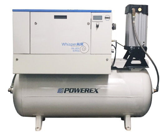
Simplex configuration with installed desiccant dryer