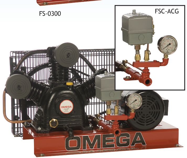
FS-0300 WITH AUTO CONTROL GROUP